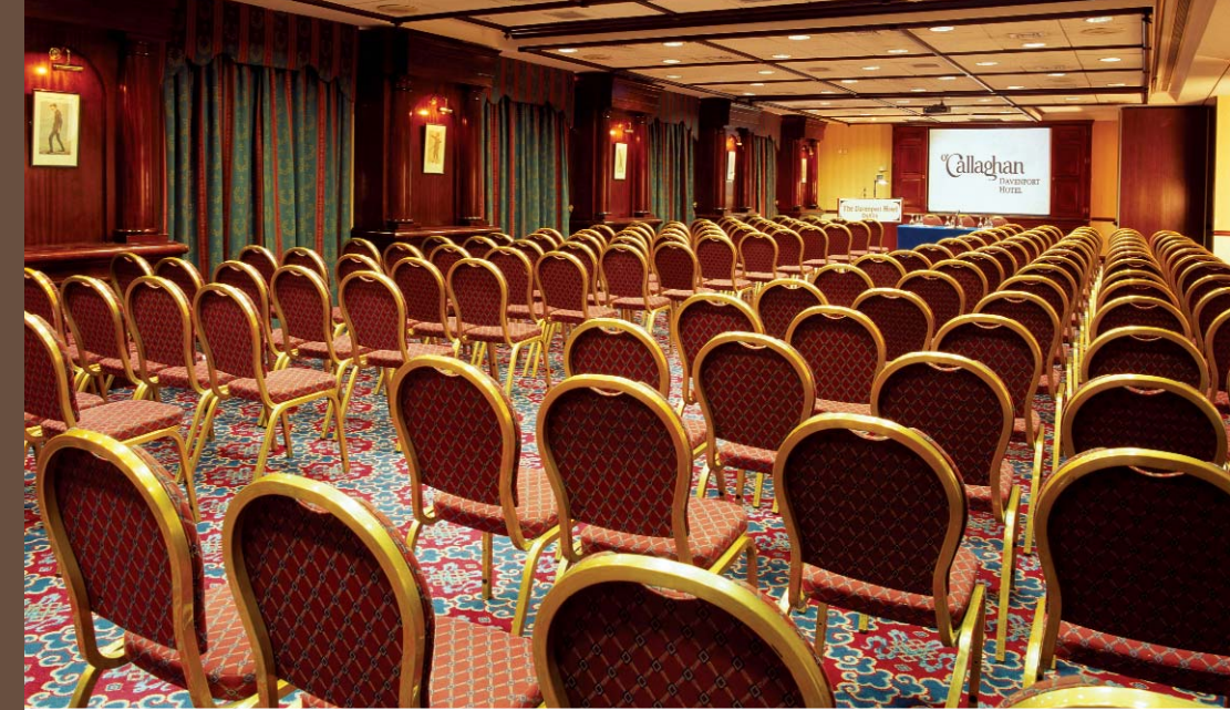
The Gandon Suite (North)

Telephone: + 353 1 607 3500 Facsimile: + 353 1 661 5663 Email: info@ocallaghanhotels.com Web: www.ocallaghanhotels.com